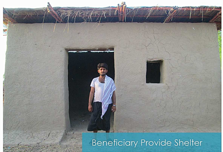
Beneficiary Provide Shelter

Besides, the MDF team working in those areas strives to resolve the social and tribal conflicts that are hindering the socio economic progress of the communities in the district. The tribal conflicts amongst tribes are increasing and the number of murders is also rife. The MDF team has suffered due to the presence of some anti-social elements that has promoted violence, uncertainty and insecurity in the vicinity. The conflict that erupted between dacoits and law