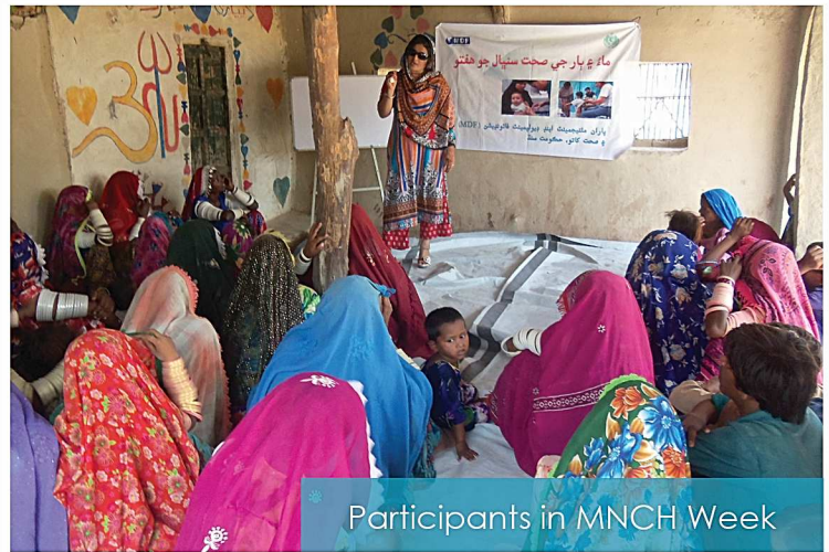
Participants in MNCH Week

MDF team has provided the local communities with agricultural extension services through continuous support from Arid Zone Research Institute (AZRI) to promote disaster resilient crop varieties and counter the menace of water shortage in the district. The team has given sessions on health and hygiene promotion and it has voluntarily provided its vehicle to celebrate the Maternal and Neo-Natal Child Health Care week in collaboration with Government of Sindh. The team is also promoting social forestry practices by promoting the plantation of Neem and Conocarpus trees in the district. Through these cross cutting interventions it is anticipated that the socio economic conditions of these communities will