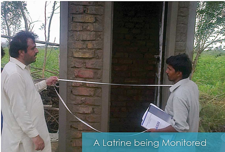
A Latrine being Monitored

MDF in collaboration with Community Development Program (CDP), Government of Sindh is addressing the increased need of safe drinking water supply and sanitation facilities in UC Atta Muhammad Palli, Taluka Umerkot, District Umerkot through the provision of 300 hand pumps and 300 latrines in the 27 villages of the UC with the active involvement of local people with the installation and construction of hand pumps and latrines respectively.