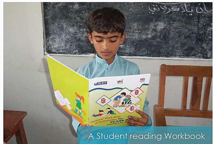
A Student reading Workbook

MDF in collaboration with Ilm Ideas is implementing the pilot project titled, "Teaching Mathematics & English Through Interactive and activity based learning to Enhance Learning Achievements of Girl and Boy Students in Government and Private Primary Schools" by designing Sindh Text Book Board Books in the form of teacher's activity based learning manual in Mathematics and English subjects to teach girl and boy students and students calligraphic workbooks to enhance enrolment and learning environment achievements in 30 Public and 5 Private Primary Schools of Union Council Seerani, District Badin, Sindh province.